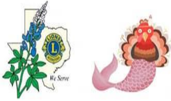
San Marcos Bluebonnet Lions Club