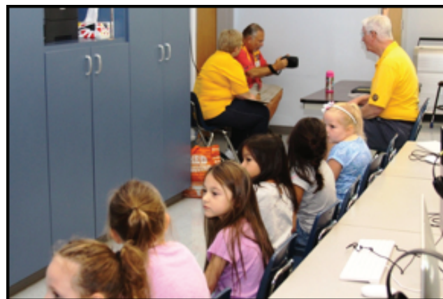
Pre-K children were queued for vision screening where the Lago Vista Lions performed the actual vision screening in the back.